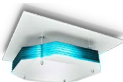
Disinfection Upper Air